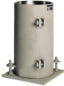
55-C0100/MC15, 55-C0100/MCIN, 55-C0100/MC16